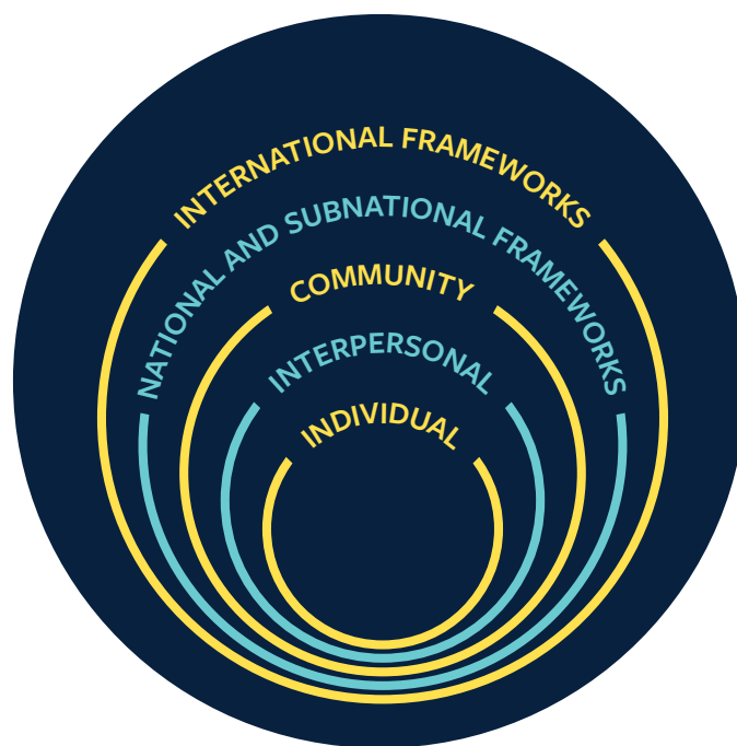
Figure 3 Multiple levels of action for gender equality: the sociological model

Norms do change. Women’s mobilisation has been central to changes in areas once viewed as ‘normal’ and difficult to change – for example, shifting norms around education, violence, work and leadership. As the socio-ecological model in Figure 3 shows, women’s organisations and feminist movements can often provide a critical link across individual, interpersonal, community, sub-national to national and international spaces, enabling changes to take root and to last.