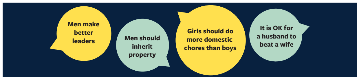
Figure 2 Examples of gender norms

Patriarchal attitudes and behaviours are often gender-discriminatory and are so normalised they can be difficult to perceive, let alone change. They shape outcomes: girls are kept out of school to perform household duties; early marriage and sexual violence persists; women are paid less than men; and women are not permitted to own property, inherit land or open a bank account. Norms are often understood as ‘the way things have always been’, ‘too complex’ to address, or too far outside the scope of mainstream work to improve well-being (such as through social protection schemes).