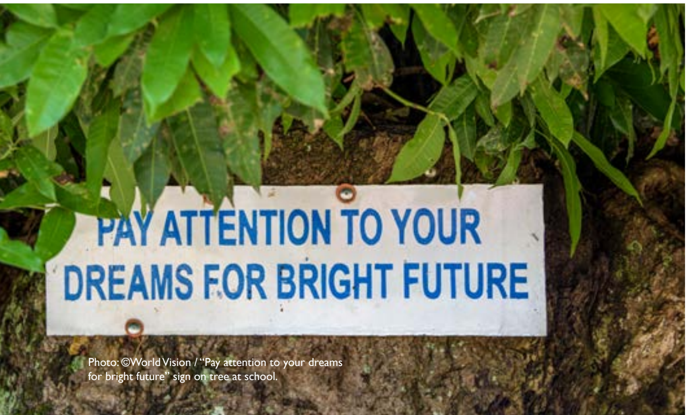
"Pay attention to your dreams for bright future" sign on tree at school.

Designing or adapting existing intervention models to reduce crisis-induced risks and ensure service provision continues, strengthens the impact of response and ensures continuity of existing efforts. For example, in Bangladesh, the COVID-19 response included activities aimed to prevent child marriage through livelihoods support, continued awareness-raising and ensuring access to services. The activities were adapted to the context of the pandemic by using digital means of communication and capacity building. In Afghanistan and Uganda faith and community leaders integrated efforts to prevent child marriage in their activities to prevent the spread of the COVID-19 virus and to assist vulnerable children. In all cases, this approach was critical to ensure continuity of interventions to end child marriage and preserve achieved results.