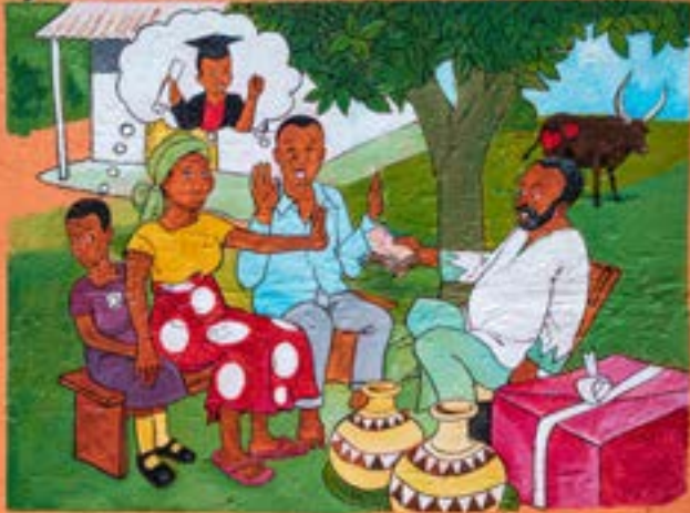
Billboard warning about child marriage in Nakasongola, Uganda.

My child's future is valuable so I say No to Child Marriage