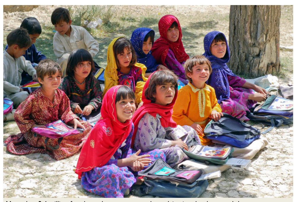
More than 3.4 million female students are currently studying in schools around the country.

Despite a massive expansion in higher education after 2001, Afghanistan still has one of the lowest gross enrollment rates (GER) in the world, at 5%. In the World Bank's global listing of enrollment rates, this is fourth from the bottom, above Burundi, Chad and Eritrea. The low enrollment rates can be traced back to the decades of war and insecurity, with institutions of higher education increasingly in decay and much of its academic staff leaving for abroad. Also, the patterns that we see as a result are consistent with the fact that the higher the education level, the lower the enrollment rates. The last decade, though, has seen a considerable change in the nature of higher education overall in Afghanistan, as the number of private universities and higher education institutions have grown almost exponentially. Over the past two years alone, the number of private institutions has almost