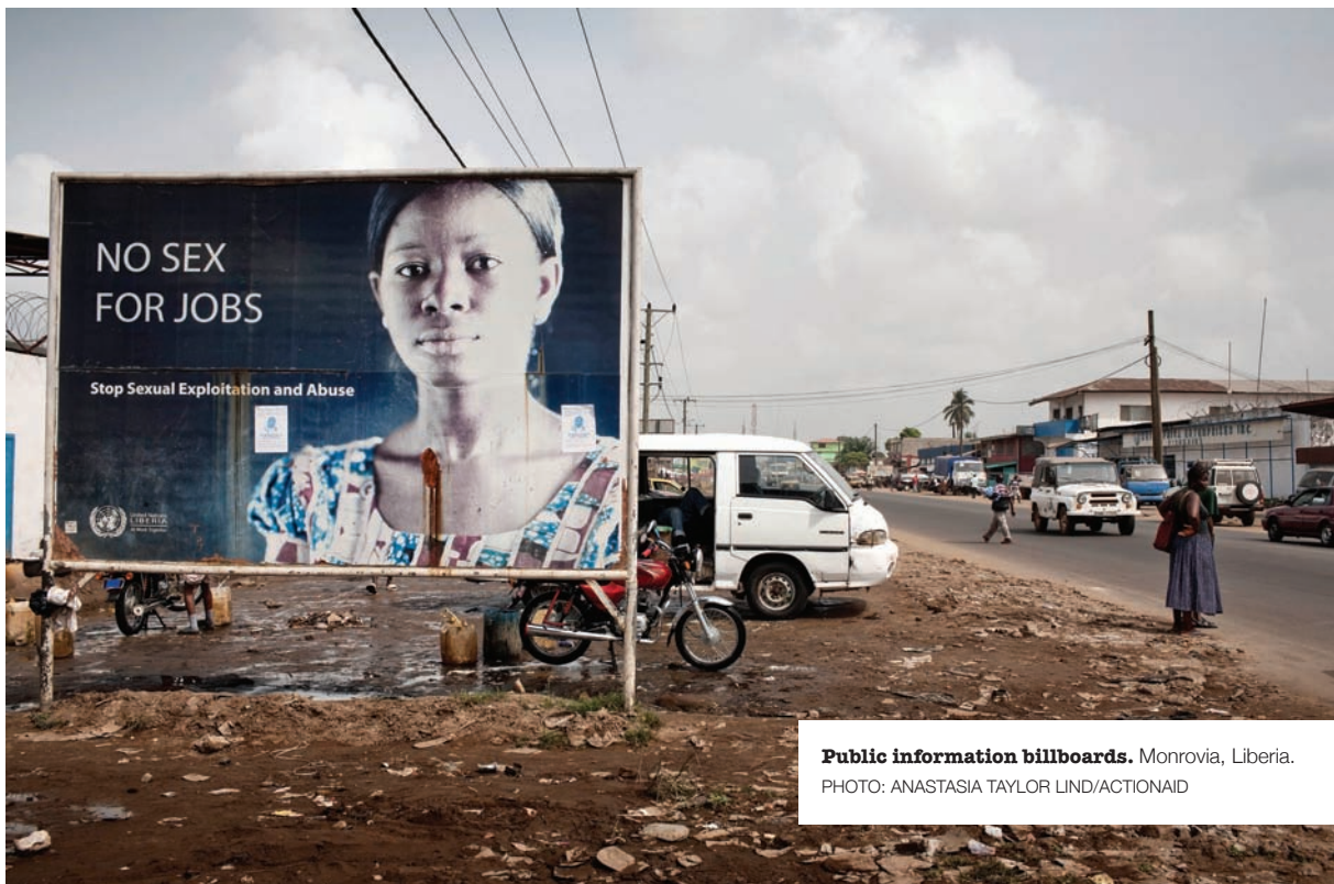
Public information billboards. Monrovia, Liberia.