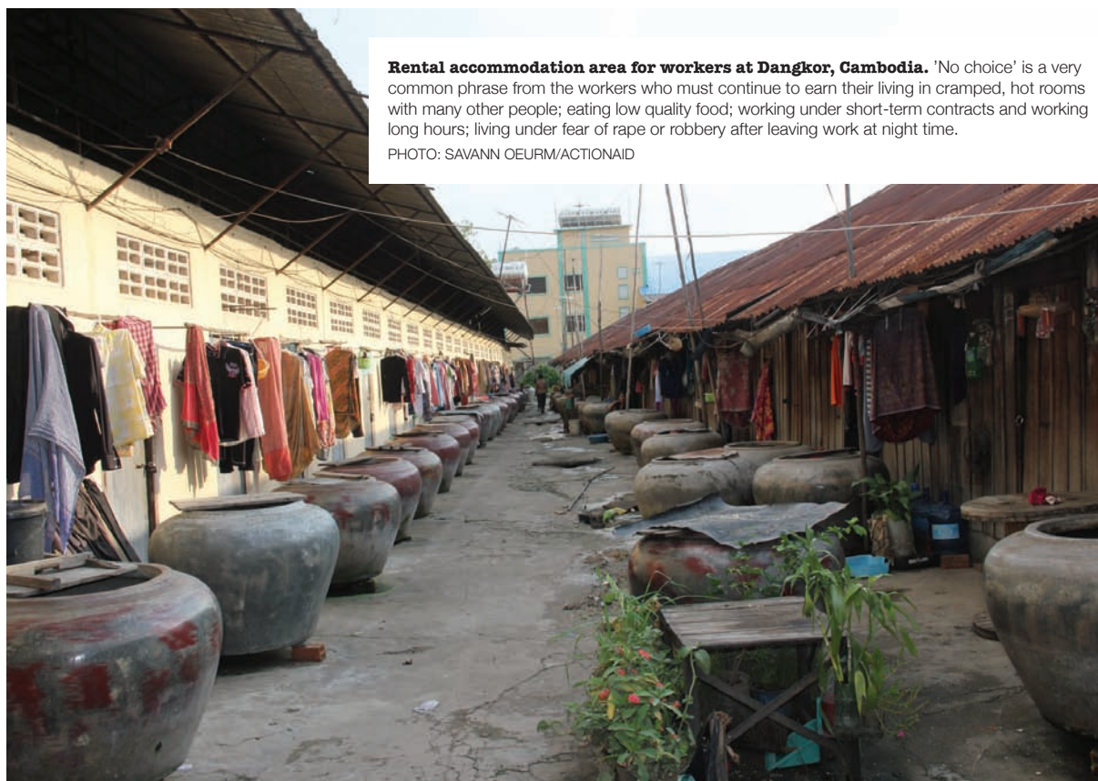
Rental accommodation area for workers at Dangkor, Cambodia. 'No choice' is a very common phrase from the workers who must continue to earn their living in cramped, hot rooms with many other people; eating low quality food; working under short-term contracts and working long hours; living under fear of rape or robbery after leaving work at night time.

policies and legislation; a reduction in violence and fear of violence experienced by women and girls; and the participation of women and girls in economic, educational, cultural and political opportunities.