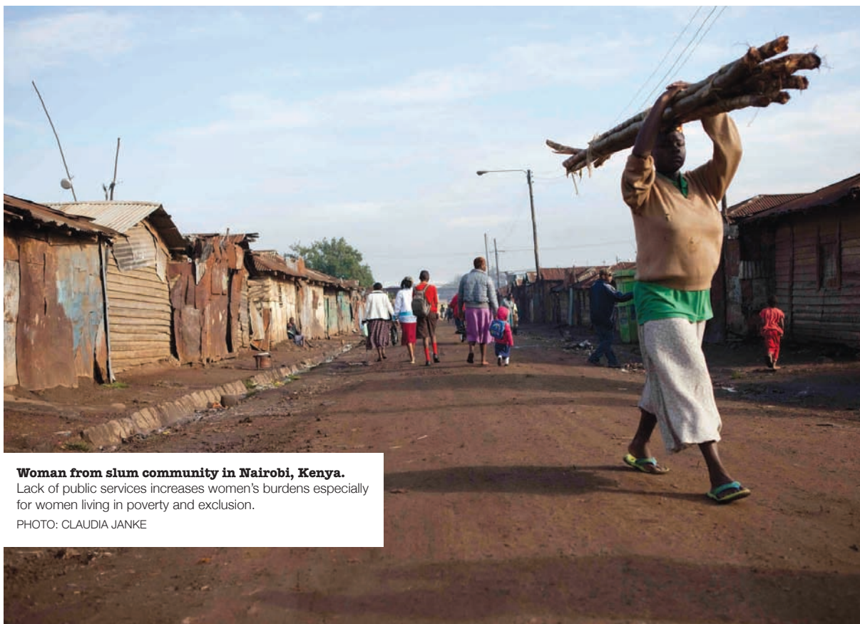
Woman from slum community in Nairobi, Kenya. Lack of public services increases women's burdens especially for women living in poverty and exclusion.