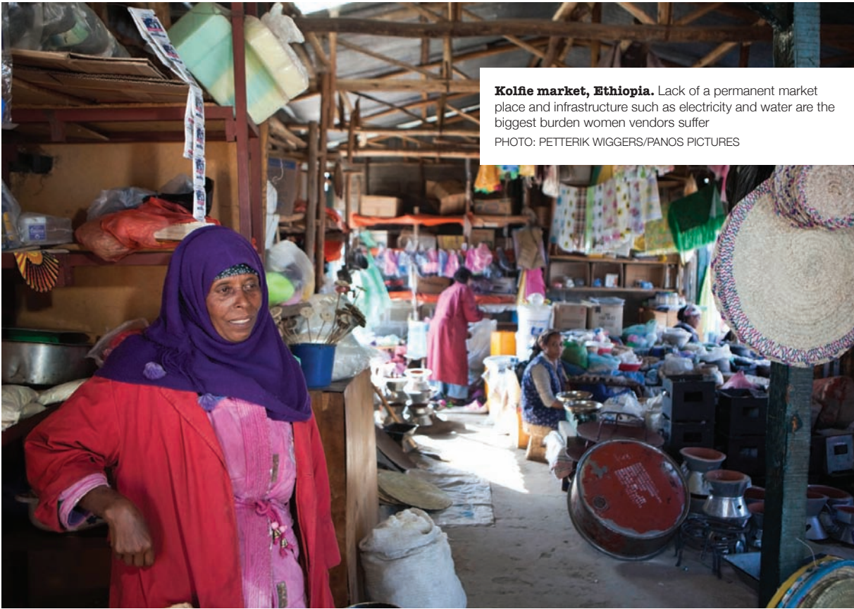
Kofie market, Ethiopia. Lack of a permanent market place and infrastructure such as electricity and water are the biggest burden women vendors suffer