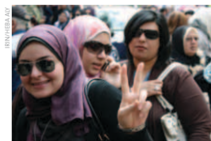
Egyptian women line up in Cairo to vote in Egypt’s first free and fair parliamentary elections of November 2011.

The period before Nasser took power had been a phase of active feminist mobilization, but this receded in the face of the regime’s restrictions on civil society activity. Independent women’s organizations were displaced by the state, which sought to reformulate gender issues in social welfare terms under the aegis of the Ministry of Social Affairs (Al-Ali, 2002). At the same time, the egalitarian thrust of Nasser’s policies had a number of positive implications for women. The constitution declared that all Egyptians were equal, regardless of gender, and granted women the right to vote and run for political office. Women’s entry into the labour force was encouraged: indeed Nasser declared it to be women’s duty to contribute to building the national economy (Hoodfar, 1997). Labour laws were changed to guarantee state-sector jobs for all holders of high school diplomas and college degrees, irrespective of gender, and to give women equal rights and equal wages with men, with special provisions for married women and mothers. The educational system was reformed to increase enrolment, both for primary and secondary education. Given the opportunities offered in the public sector, this had a particularly strong effect on female participation in higher education (Ahmed, 1992).