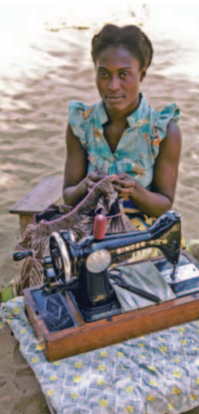
A Congolese woman sews in the shade of a tree.

Of the other pathways variables, education showed the most consistent positive correlations with our empowerment indicators. Women with primary education were more likely than those without to be consulted for advice by others in their community and to report that their family valued their work. Women with secondary education were more likely to have access to formal savings, vote in local and national elections, and consider that they had control over their own lives. Women who owned land and/or homes were more likely to decide on their use of their income, to have formal savings, and be consulted by others for advice.