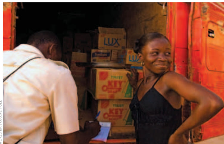
A store clerk accepts delivery in Ghana.

Ghana started its post-colonial history with a brief and successful period of import-substituting growth strategies. It then went through a period of major turmoil, which nearly precipitated its economic collapse. It was forced to turn to the World Bank/IMF for assistance in the mid-1980s. The ensuing