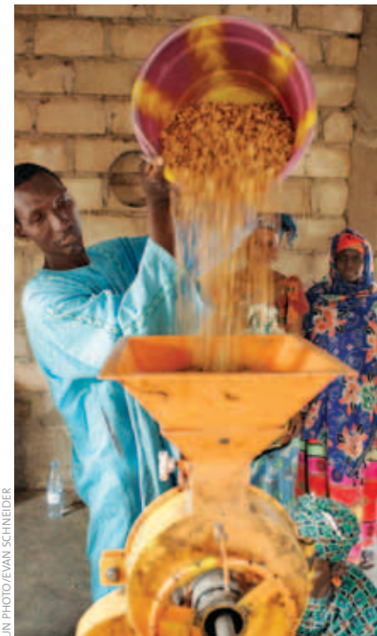
Members of the Sourouyel Women’s Group bring peanuts to the miller for grinding before making peanut paste to be sold in the women’s Senegal village and local markets.

The West African region, where Ghana is located, exemplifies what Boserup described as ‘female farming systems’, a description that serves to stress women’s significant contributions to agriculture in the region. Women in Ghana have a long history of independent farming. They also play a major role in agro-processing and trade, manage their own budgets and are considered to exercise considerable economic autonomy. Indeed, as Darkwah and Tsikata (2011) note, Ghanaian women featured in Boserup’s writing as exemplars of female autonomy. At the same time, they point out that because the high rate of economic activity by women is taken for granted in much of the Ghanaian literature, its impact on their lives tends to be assumed rather than investigated.