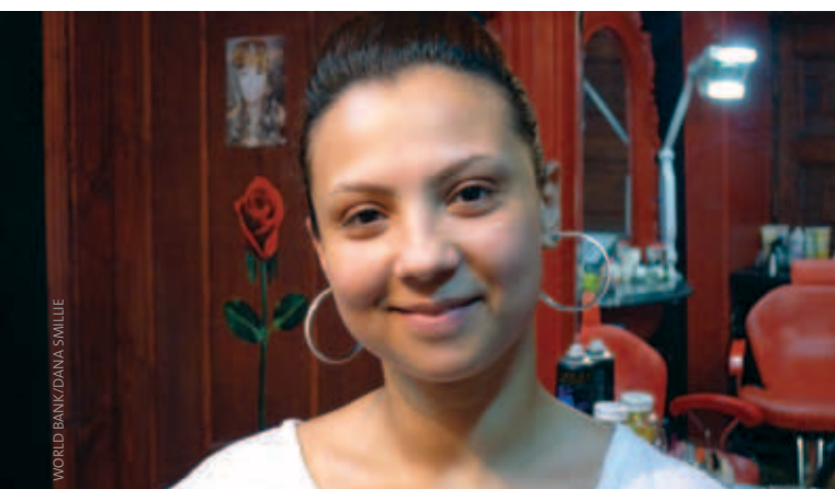
A young business owner greets customers outside her salon in Cairo, Egypt.

While the Pathways sample highlights the importance of formal employment for the female workforce in Egypt, it does not mirror the distribution of the female labour force in the 2006 Labour Force Survey in which just 9 per cent of the female labour force (aged 15 years and older) were in formal employment while 60 per cent were economically inactive. 11