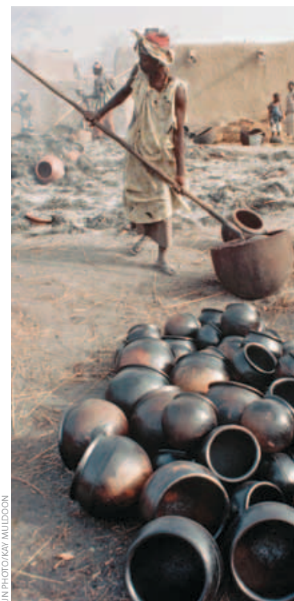
Women fire newly made pottery in the village of Kalabougou, Mali.

The regulatory environment can constrain or enable women's economic agency in other ways as well. For example, in the Democratic Republic of the Congo, where women need their husband's consent to start a business, women run only 18 per