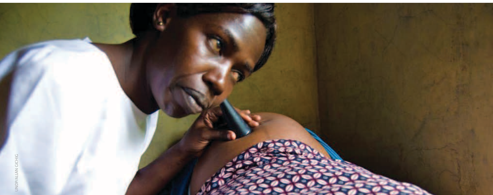
A nurse listens to the heartbeat of a foetus at a local dispensary in western Kenya.

Creating a more enabling regulatory environment will require action on a number of different fronts. One front is addressing discriminatory legislation, in particular legislation that requires women to seek permission from their husbands to open bank accounts or own businesses. Inheritance and property laws are another example of discriminatory legislation. Laws governing these issues, both customary and statutory laws, should be gradually aligned in order to ensure more egalitarian rights to property. A second front is apparently gender-neutral legislation that may have gender-biased impacts. For example, the complex bureaucratic procedures necessary to register enterprises not only discriminate against small enterprises they also discriminate against female entrepreneurs who are less likely than their male counterparts to have the knowledge, time and money to negotiate the barriers they represent. Similarly, the design of value-added taxes may unintentionally discriminate against goods and services provided by women. A third front is promoting legislation that seeks to level the economic playing field for women and men: state support for maternity leave and benefits to lessen the financial burden on private employers; legislation promoting equal pay for work of equal value; and progressive extension of basic labour standards throughout the economy.