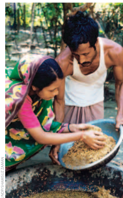
Spouses work in the family's business in Bangladesh's Kishoreganj district.

Bangladesh, along with the rest of South Asia, had some of the lowest ratios of public revenue to GDP among developing countries (around 8 per cent in the mid-1980s). Public expenditure on health and education as a ratio to GDP was considerably lower in Bangladesh than in Egypt and Ghana. However, since then, Bangladesh has performed unexpectedly well on social development indicators compared to other low-income countries—and better than its more prosperous neighbours (India and Pakistan). Expenditure on health and education has been rising as a share of public expenditure, including during the period of structural adjustment so that its ratio to GDP also rose (Mahmud, 2008). The construction of an extensive network of rural roads and transportation links has also played a role in improving access to services and increasing the connectedness of rural communities, which has had important implications for gender equality on some key social issues.