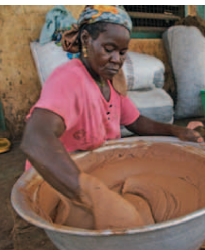
A women of the Tung-Teiya Shea Butter Extraction Women's Association makes shea butter by hand from roasted shea nuts in Tamale, Ghana.