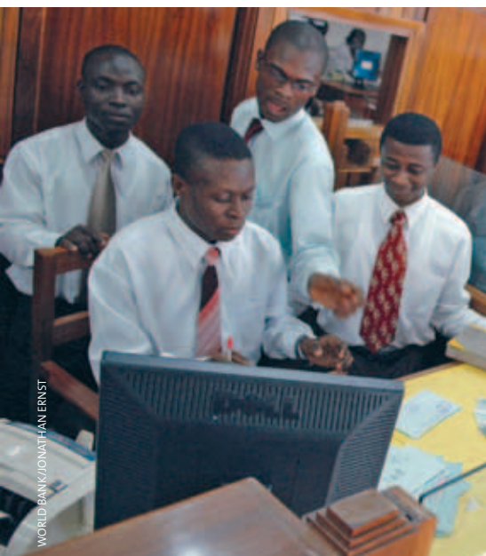
Left: Tellers gather at a computer screen at the Mamfe, Ghana-based Akuapem Rural Bank Ltd. Right: Women work a field in Ghana.

Explanations for the persistence of high levels of poverty have centred on the absence of significant structural transformation of the economy. Ghana is as dependent today on its geographical characteristics and resource endowments as it was in colonial times. While the share of services in the GDP has increased, most of it derives from lower order service sectors such as wholesale and retail trade as well as restaurants and hotels. The share of industry in GDP has been declining, despite the rise in the share of mining and construction in the GDP, largely because of poor performance by the manufacturing sector.