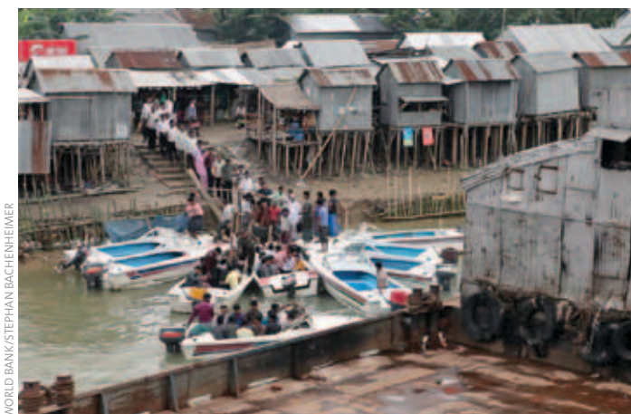
Ferry point at river in southern Bangladesh.

Agriculture has remained the major source of employment for both women and men, but its share of the male labour force has declined from around 50 per cent for much of the late 1990s to 40 per cent in 2010. Its importance for the female labour force, however, has increased steadily from 28 per cent in the mid-1990s to 65 per cent in 2010. The growing importance of agriculture as a source of employment for women appears to reflect a change in the growth rates related to the share of agriculture in GDP: 1.5 per cent in the early 1990s to 5 per cent in the late 1990s. This growth rate trend is coupled with the movement of men into off-farm activities and the growing demand for female labour to replace them. It may also reflect women's growing involvement in livestock rearing, one of the major impacts of their access to microcredit.