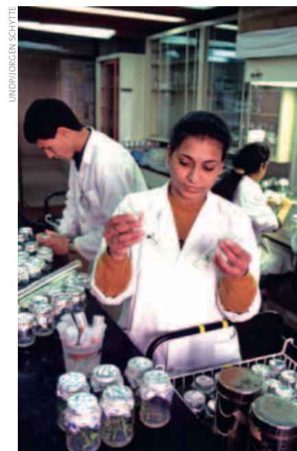
Egyptian scientists learn from nature.

Of the other pathways hypothesized to be of importance for women's empowerment, education (particularly secondary and higher levels of education), proved more significant than the rest in all three country contexts. Here state policies have played an important role—Egypt through its public-sector employment guarantee to those with secondary and higher education and in both Ghana and Bangladesh through the active encouragement given to girls' education as a part of an overall drive towards universal education at primary and secondary levels.