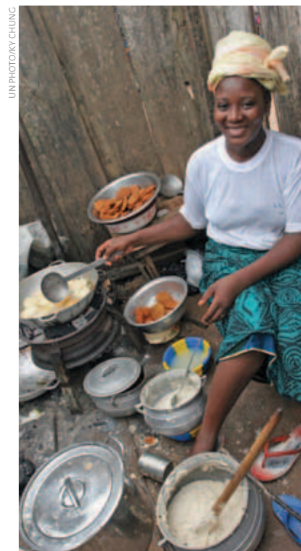
A woman prepares snacks to be sold at the roadside in San Pedro, Côte d’Ivoire.

This report draws on survey data collected as part of the ‘Empowering Work’ theme of the Pathways programme in order to address this knowledge gap. The Pathways surveys were not designed to explore linkages between women’s work and economic growth, but rather took women’s empowerment as a valued goal in its own right and set out to investigate the circumstances under which women’s access to paid work was likely to be empowering. This report takes the analysis a step further by bringing the survey data together within a comparative framework. This will allow us to carry out a more detailed, historically grounded and contextually located analysis into the extent to which the structure of economic opportunities generated by a country’s growth strategies translated into positive impacts on women’s lives in three different contexts: Egypt, Ghana and Bangladesh.