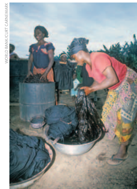
Ghanaian women die cloth.

The occupational distribution of the sample captures the relative significance of the varying categories—with non-agricultural self-employment and farm/home based self-employment constituting the two main sources of employment, and with negligible percentages of women in formal waged employment (6 per cent at national level compared to 9 per cent in the Pathways sample) and informal waged employment (3 per cent at the national level and 4 per cent in survey sample).