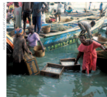
Ghanaian women fishing.

Kabeer and Natali (op cit) found more robust evidence for the hypothesis that gender equality in employment and education contributed to economic growth. One important pathway through which this occurs is through market forces. The argument is that greater gender equality in access to education and employment will expand the quality of human resources the economy is able to draw on and lead to a more optimal allocation of these resources—conditional, of course, on markets functioning efficiently to achieve such outcomes. This is the crux of the 'gender equality is smart economics' argument put forward by the World Bank (2006). The micro-level nature of our findings means that they cannot throw much light on these larger externalities, but the absence of sizeable percentages of educated women from the active labour force was noteworthy in all three countries. Much more work on demand for labour within the economy is needed to establish whether this underutilization of educated female labour represents a preference on the part of women and their families or a dearth of suitable employment opportunities.