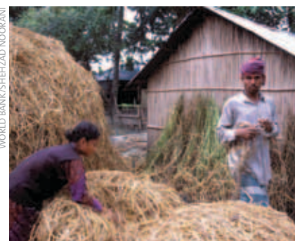
A young woman helps her father gather hay to use as fodder for family cattle.