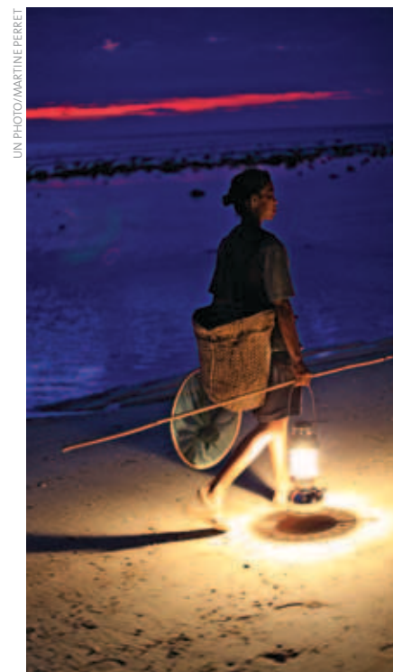
Dili, Timor-Leste woman collects fish at sunset.

Current discussions about inclusive growth give employment generation a central place in the policy agenda and envisage a greater role for the state, not simply as a passive partner to the private sector, but proactively creating conditions that will allow countries to embark on more dynamic growth trajectories. The expansion of economic opportunities through greater attention to the employment potential of growth strategies would clearly create more hospitable macroeconomic conditions for achieving women's economic empowerment.