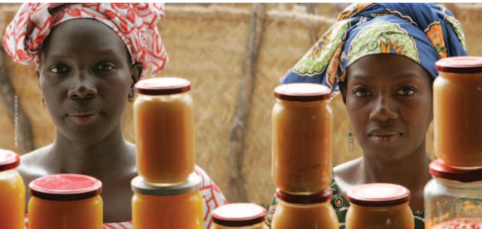
Women of the Senegal village Bantantinti show off the mango and sweet potato jam ready for sale.

The other pathways varied in significance. Ownership of residential land/housing proved insignificant in Egypt where very few women reported such ownership; it appeared to have a stronger impact in Ghana and an even stronger one in Bangladesh. Membership of associations was also rare in Egypt and largely confined to women in formal employment who belonged to state-managed associations. Many more women overall, and within the different work categories, belonged to associations in Ghana and Bangladesh where civil society associations had greater freedom to flourish. The implications of associational membership for women's empowerment appeared to be more positive in Bangladesh than in Ghana, possibly because the NGOs in question in Bangladesh were more likely to stress the importance of the kind of changes embodied in our empowerment indicators.