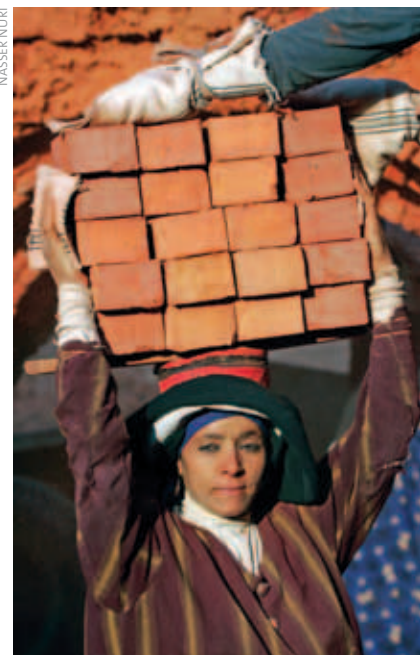
An Egyptian woman worker stacks bricks at a brickyard kiln factory near Mansoura city.