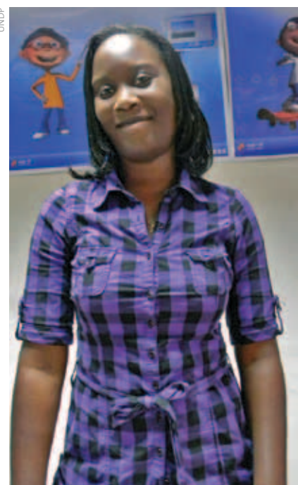
A CEO of an Accra, Ghana-based company that creates educational software for students, universities and government institutions.