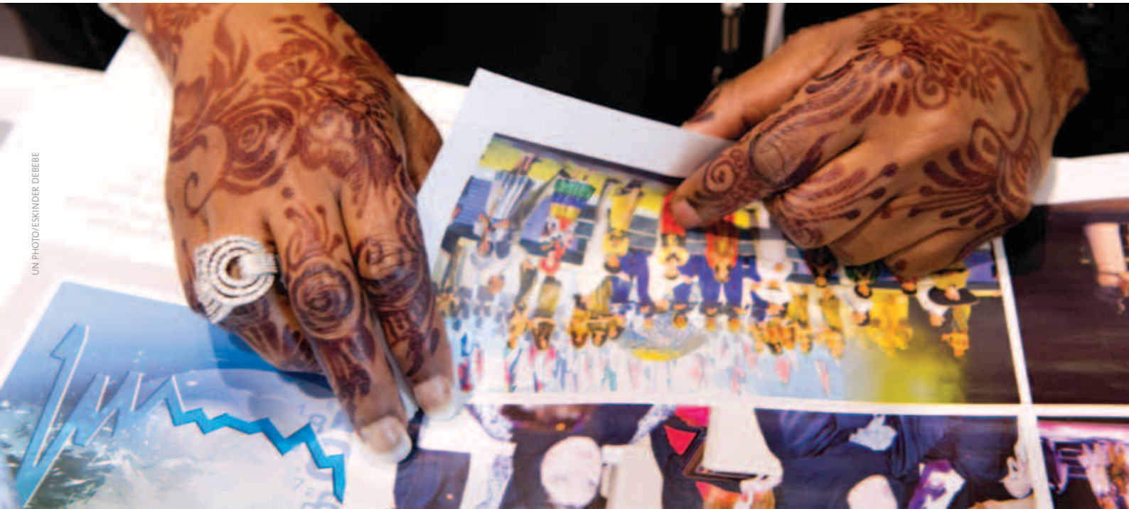
An attendee leafs through materials at the 13th UN Conference on Trade and Development in Doha, Qatar.