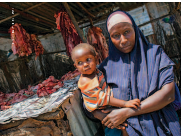
A woman stands at her meat kiosk, holding her child, in a market area of southern Somalia's port city of Kismayo.

In addition, while a minority of women said they felt under constant pressure, this feeling was somewhat higher among women in paid work than unemployed and inactive women. This is likely to reflect some of the real stresses of combining income-earning activities with their socially sanctioned domestic responsibilities, particularly when such work has to be carried out outside the home. At the same time, a very high percentage of women appeared to be hopeful about their own future, with women in formal employment most likely to express such optimism and women in outside informal work least likely. Finally, women in formal employment were most likely to believe that they had considerable control over their own lives, while women in outside informal employment and the economically inactive were least likely to express this view.