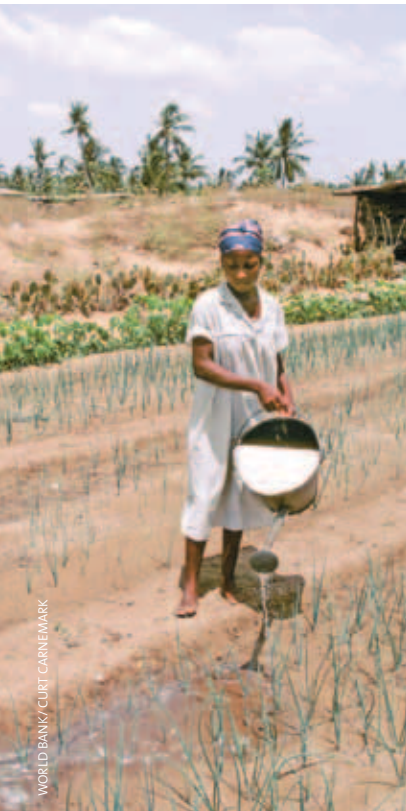
A woman waters a field in Ghana.

Moreover, as with all ideal-typical descriptions, the reality is more varied and complex. There are a variety of agro-ecological conditions in Ghana, from arid savannah in the north to forest and coastal environments in the southern regions. It has over 60 different ethnic groups, although the Akan (44 per cent), Mole-Dagbani (16 per cent) Ewe (13 per cent) and Ga-Adangbe (8 per cent) make up the bulk of the population. Different groups are characterized by different kinship systems with different implications for access to resources and decision-making power by gender. The result is considerable diversity in household arrangements, with varying incidence of polygyny, non-coresident marriage, kin fostering and consensual unions.