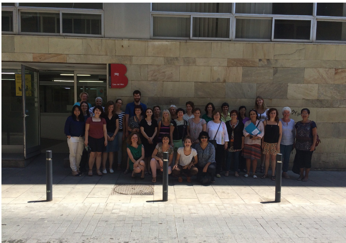
All participants during the coffee break outside

Feminist movements and networks -such as WIDE+- should continue to address VAWG and SRHR and expose the economic impacts of these. VAWG is a cause and a consequence of