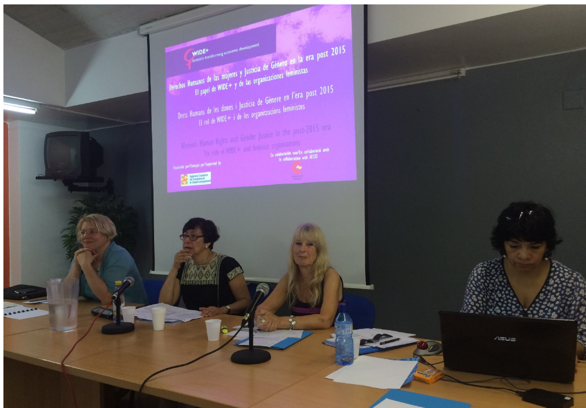
Speakers during the first Plenary Session

agreements do not have an adverse impact on women's new and traditional economic activities (para. k); and that "corporations, including transnational corporations, comply with national laws and codes, social security regulations, applicable international agreements, instruments and conventions, including those related to the environment, and other relevant laws (para. l). 1