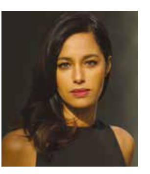
Rula JEBREAL (Italy-Israel-Palestine) Journalist, author, and foreign policy analyst